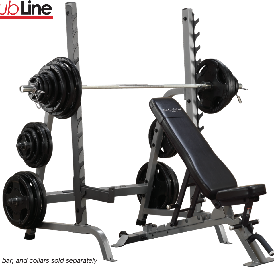
*Weights, bar, and collars sold separately