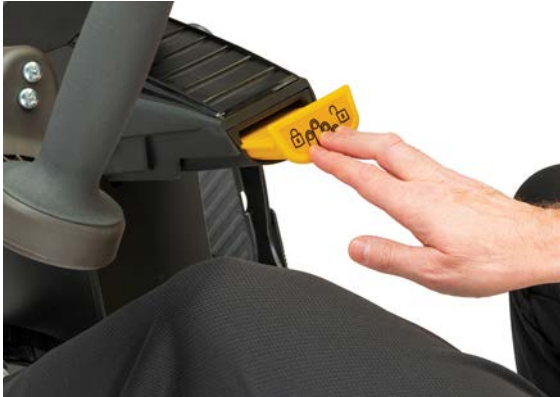
StrideLock® feature locks handles and pedals