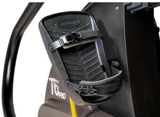
Adjustable foot straps to fit every user