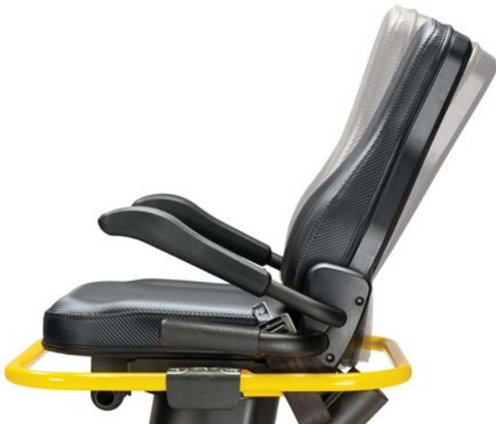
12-degree seatback recline offers maximum comfort